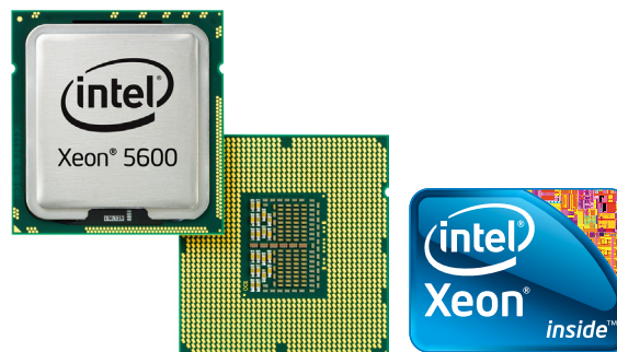
Figure 3. Intel Xeon 5600 Series Processor